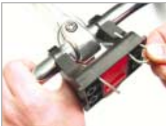
Fig 2 (underside)

Attach both halves of mounting face plate on to basket making sure slotted half is on the outside and bevelled edge is down.